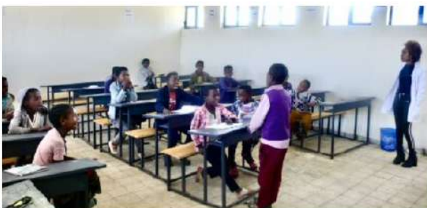
First graders in HMCHA's new school

With great joy and excitement, prepared with notebooks, pens and uniforms, your sponsored children returned to school just before Christmas. Some went back 5 days a week, others for 3 days because of social distancing. Out of school since last March, all students except for 8th graders, were passed to the next grade. HMCHA 8th graders studied hard for this important exam that determines if they continue to high school or repeat 8th grade. Out of ten of your children who took the exam, seven passed and three are still waiting for results. What an accomplishment for rural sponsored students! Only about half of Ethiopian students finish 8th grade, but all of HMCHA children do. Your sponsorship makes a huge difference!